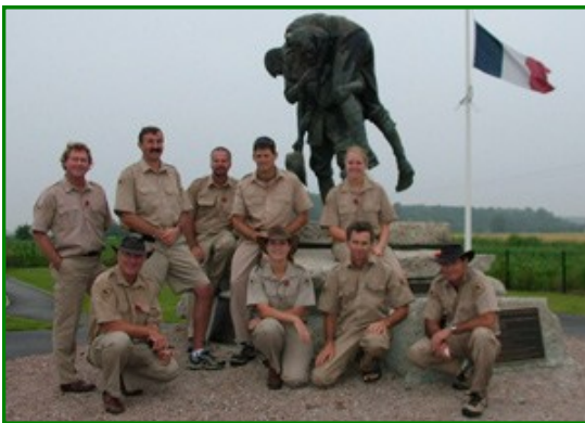
Emu Gully in the Lockyer Valley