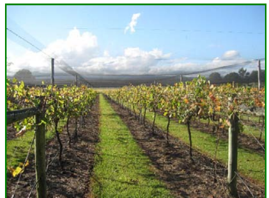
Woongooroo Estate near Kilcoy