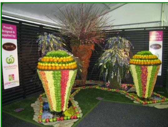
Toowoomba Carnival of Flowers